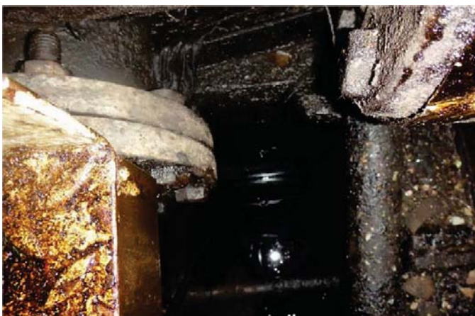
Oily bilges in the Engine Room