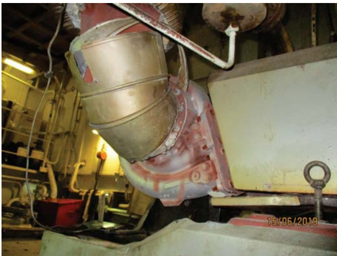
Damaged and missing insulation of the engine exhaust gas turbocharger and uptakes

The importance of engine room cleanliness and a general fire safety culture cannot be overemphasized.